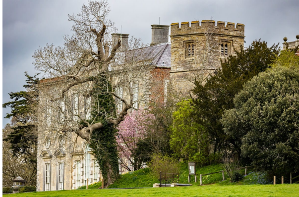
The team are busy behind closed doors preparing to re-open Claydon House in May.

And as if that wasn't enough, nearby Claydon House will be re-opening to visitors again for the 2022 season from Friday 6 May . Claydon will be open on Fridays and Saturdays between 11am and 3pm until October (pre-booking recommended). Discover sumptuous interiors or explore the grounds, taking your visit at your own pace.