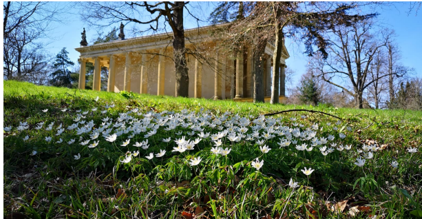
Wood anemones in the Grecian Valley at Stowe

nationaltrust.org.uk/ stowe/features/ spring-at-stowe