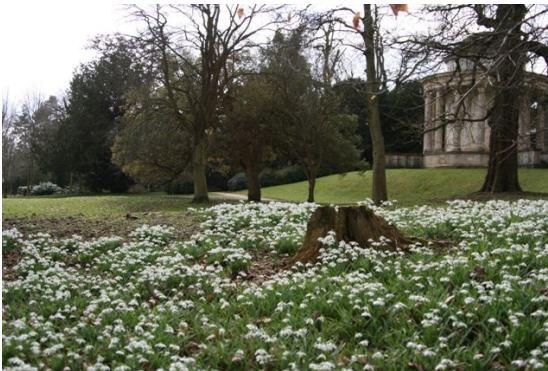
Snowdrops at Stowe

Despite everything going on around us nature continues to flourish in the gardens. Snowdrops are starting to emerge and blanket the landscape. Enjoy chilly walks to spot signs of them peeping through as they begin to appear throughout the Elysian Fields, Sleeping Wood, Grecian Valley and Lamport Garden. We're excited to bring back our snowdrop walk, with special paths re-opened for this season to see the best of these delicate flowers. The route will re-open on 15 January when a walk map will be available to download to guide you around the best snowdrop spots in the garden.