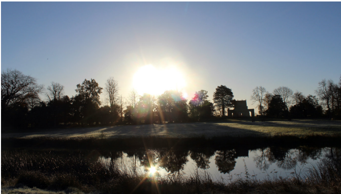
Winter sunlight shines over the Temple of Friendship